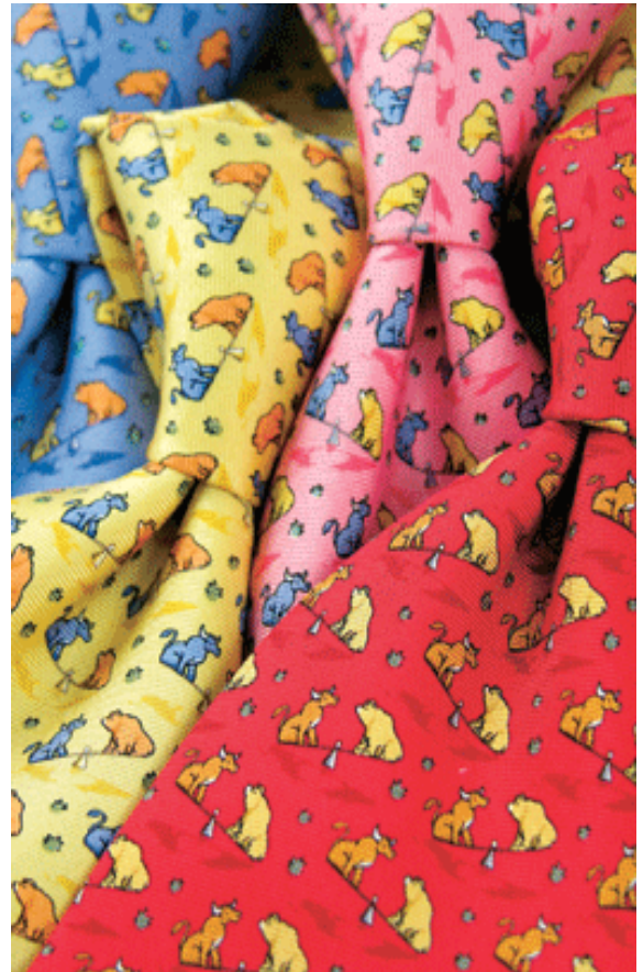
Bird Dog Bay's brightly colored ties feature bulls and bears on seesaws.

Some Lee Allison ties weave the pattern with different-colored silk threads. On others, the pattern is screened onto silk fabric. Woven ties look richer, but printed ties are lighter weight and allow use of more colors. Lee Allison sells both printed and woven ties; all Bird Dog Bay ties are printed.